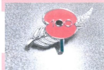
WW100 Poppy/Fern Pin