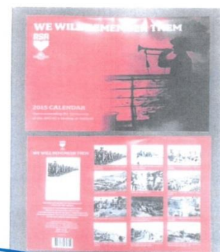
We Will Remember Them Calendar RRP $14.99 Inc GST