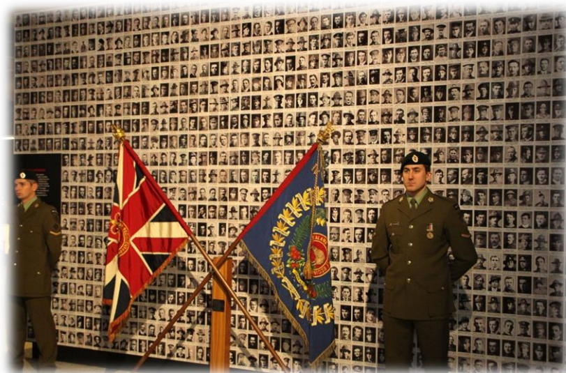
ABOVE: Photos from the opening of the