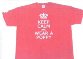
Unisex Keep Calm Tee Red