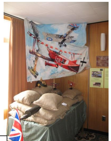
Part of the WW 1 display at Ranfurly Council Chambers

Lawrence and the memorabilia displayed at the Ranfurly Council Chambers showing the sacrifices made during WW1 by these small communities.