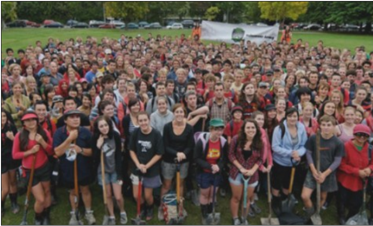
The Student Volunteer Army

The recipient of the Royal New Zealand RSA's Anzac of the Year Award 2012 is the Student Volunteer Army , in recognition of its significant contribution to the Christchurch community following the earthquakes of 2010 and 2011.